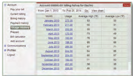
Usage history in list form