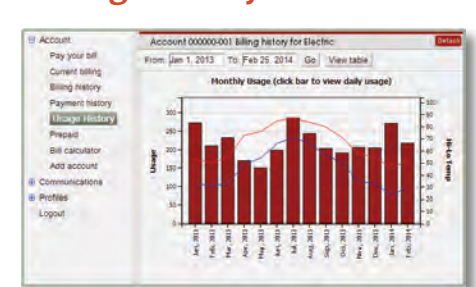
Usage history in bar chart